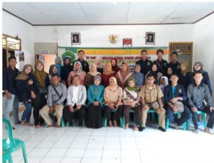
Figure 3. Communities participation

Based on the level and extent of cooperatives that are suitable in Banyu Asih village are primary cooperatives, it's a cooperative established by at least 20 people who subsequently become members of the cooperative itself. So the working area includes one work environment, it can also be from one village or one village. Based on the field of business and analysis developed from the PKM Team (Universitas Matlul Anwar Banten and the University of Prof.Dr.Moestopo (Religious) Jakarta, the suitable cooperatives in Banyu Asih are multi-purpose cooperatives, namely cooperatives that have multiple fields or many businesses. Village Unit Cooperatives (KUD) and multi-business cooperatives.