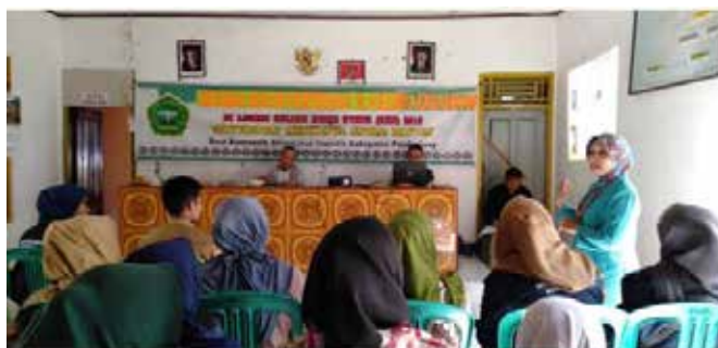
Figure 4: dialogue activity during the entrepreneurship and koperasi socialization

At the time of service PKM participants were asked to mention what businesses they wanted to start, those who had or who did not have a business, then a group discussion session was made on how the stages of the business they wanted to start and the desired process and outcome, so the Team knew the extent where people know the business world and the business potential that exists around their environment.