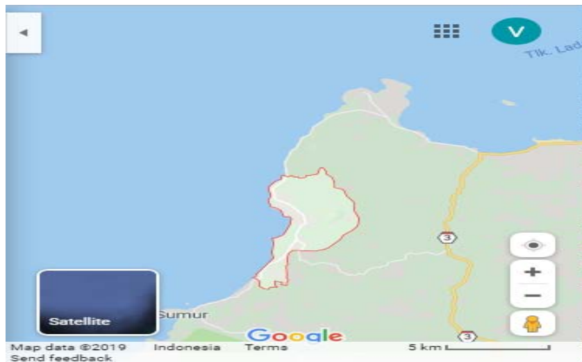
Figure 2. map of Banyu Asih, Cigelis sub-district Pandeglang Banten

Banyu Asih Village is a village that has a coastal area that has natural potential, the potential of marine products that can be used as a source of business for the community. The trauma of the Sunda Strait tsunami has become a problem in re-cultivating marine products. To raise the spirit of entrepreneurship is considered very important considering the rural community needs a sector to generate business sector so that there is no large urbanization to the city. Cooperatives are the right vehicle in realizing the people's economic goals that are strong and resistant to the threat of crisis.