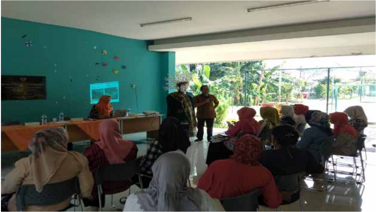
Figure 2. Provision of material on Product Maintenance Strategies at SMEs