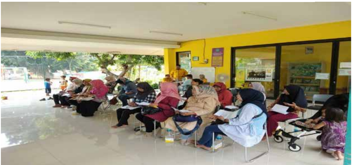
Figure 3. Participants in the Product Maintenance Strategy & Socialization Training at SMEs