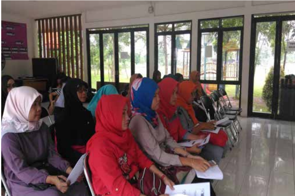
Figure 4. Participants on Socialization & Training on Implementation of Production Strategies in the Creative Economy to the community