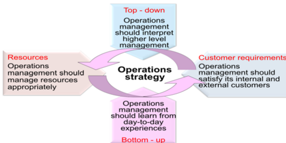
Figure 1. The four perspectives on any Operations strategy

Operations strategy is the total decision pattern that forms the long-term capability of all types of operations and their contribution to the overall strategy, through reconciliation of market requirements with operating resources. Operations strategies are decisions that shape the long-term capability of a company's operations and its contribution to the overall strategy through ongoing reconciliation of market needs and operating resources (Slack; 2011).