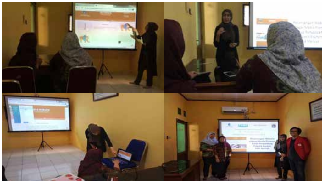
Figure 5. Training Process of ULS Meruya Website Management

After the web design has been completed, the next session is training the ULS officers to manage the information and the promotion through the web. The activities in this session might be consulted in the following figures.