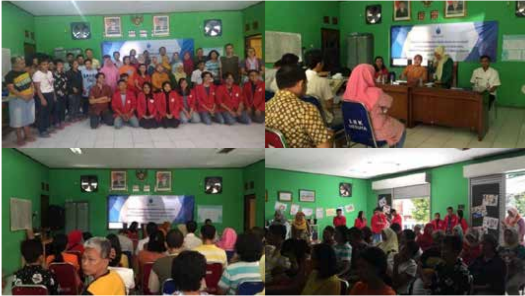
Figure 6. Closing Session and MoU and MoA Signs between the Unit of Community Service from Mercu Buana University and the caretakers of UILS Meruya

Source: Team of Community Service & Faculty of Design and Creative Art, Mercu Buana University