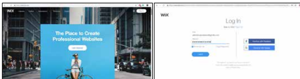
Figure 1. Entrance and Registration Process in Wix

The website design activities have been prepared prior to the conduct of the Community Service Program. Then, the activities begin with the e-mail registration and identity completion for the UILS Meruya so that the caretakers of UILS Meruya might access Wix (the web platform) easily. Then, the template of the web design has already been available in the web platform; thus, during the conduct of the Community Service Program, both the demonstration and the training process run smoothly due to the facilitation by Wix. The tools in Wix are user-friendly. Not to mention, through Wix the caretakers of UILS Meruya might easily add texts and pictures in the similar manner to the operation of MS Office. As a result, the caretakers of UILS Meruya might easily get familiar to the web platform. The overall process in designing the web might be consulted in the following figures.