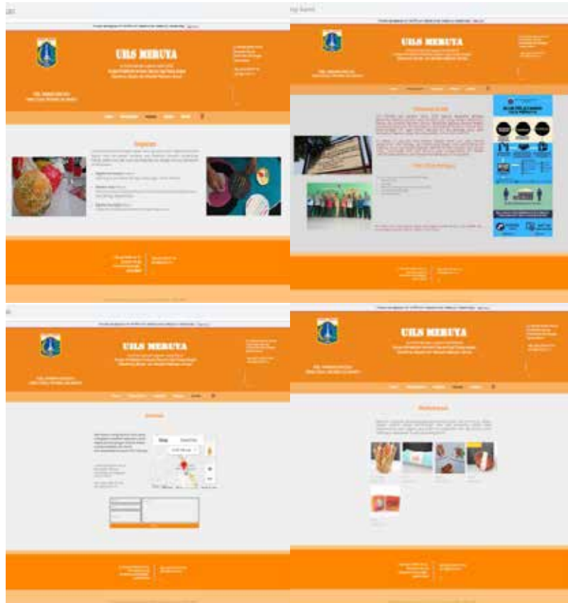
Figure 4. ULS Website

After the web design has been completed, the next session is training the ULS officers to manage the information and the promotion through the web. The activities in this session might be consulted in the following figures.