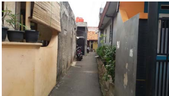
Picture 4. The transition of Function of Green Open Space into Buildings in Residential Houses in RT.03 / RW.01

Population density can be seen in houses lined up along the road. The width of the neighborhood road is 1 Sq to 1.5 Sq.