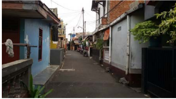
Picture 3. House of Residential Community Series RT.03 / RW.01

Population density can be seen in houses lined up along the road. The width of the neighborhood road is 1 Sq to 1.5 Sq.