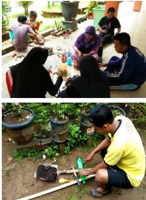
Picture 7. Training in Making Vertical Greening of Used Materials

After the community makes vertical garden by using potting media from materials that can be reused in their respective homes, this will spread to the surrounding community. In the end, vertical garden on limited land by utilizing materials that can be reused as a media pot will become a culture in the community RT.01 / RW.01 Petukangan Utara Village, Pesanggrahan District, South Jakarta.