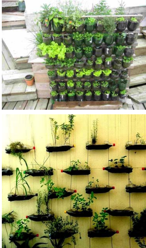
Picture 6. Examples of Plant Places from Used Bottles

After the community makes vertical garden by using potting media from materials that can be reused in their respective homes, this will spread to the surrounding community. In the end, vertical garden on limited land by utilizing materials that can be reused as a media pot will become a culture in the community RT.01 / RW.01 Petukangan Utara Village, Pesanggrahan District, South Jakarta.